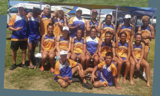
Above: Bay of Plenty Mixed Touch Below: Māori Touch Nationals 2020 (Tūwharetoa)