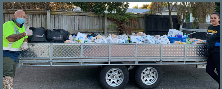
Above: Covid-19 lockdown relief packs Below: Marae development