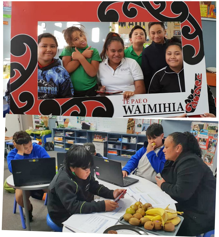
2020 saw Poipoia ōu Pumanawatanga move focus from Years 3 - 8 (above), to supporting rangatahi through NCEA (below)