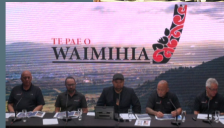
Left and above: 2020 / 2016 AGMs Below: Summer Whānau Fun Day