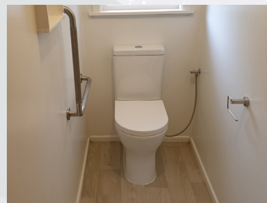
Left to right: 'Before' renovations. 'After' decking, steps and handrails. Toilet and handrails.